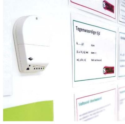
Figure 2. Examples of CO<sub>2</sub> monitors with traffic light indicator showing the indoor air quality.