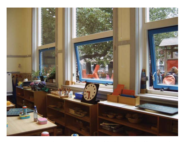
Figure 3. Open windows as much as possible during school hours and ensure airing during breaks.

In the long term it obviously makes sense to structurally improve the ventilation, since poor indoor air quality leads to headache, fatique and reduced learning performance, among other things.